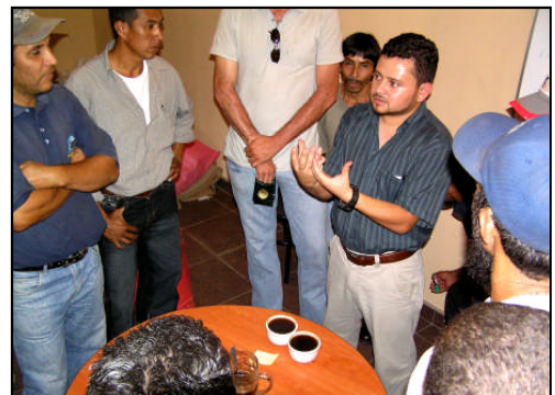
Professional cuppers from the Honduran Institute of Coffee came to the inauguration demonstrating the classification techniques used to cup coffee.

grower's coffee classified as strictly high grown and fantasy grades. Prizes were given to the top three producers of the highest quality coffee. The atmosphere was light and there was much hope for the future of coffee cultivation in the area. Producers agree that it will be a very good day when they are paid according to the quality of their product instead of one price for all regardless of coffee quality or classification. Thanks to GPC efforts in quality processing, several local producers were chosen to compete in the Excellence Cup with electronic auction in July hosted by IHCAFE.