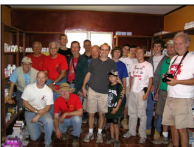
Above: Midlife Men on a Mission group poses for a picture while delivering much needed medications for the clinic.