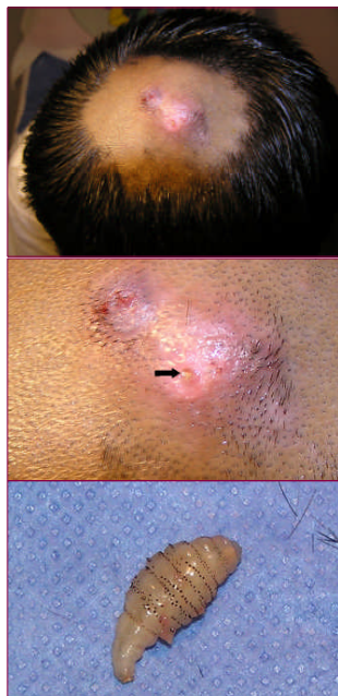
Blowfly larvae live beneath the skin of their host, breathing through a small opening. This larvae even had hair!