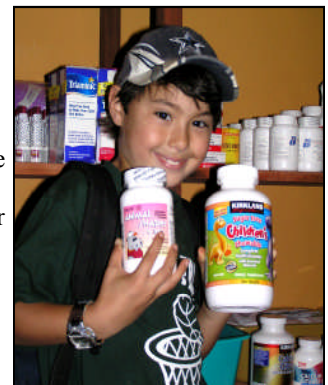
This young man sent letters to family and friends, raising over $1,000.00 to purchase vitamins for the clinic. What a great job!

behind to work on the new school construction. The team donated two thousand dollars toward the purchase of materials for the school construction. An additional donor gave $5,000.00 to assist in the costs of both materials and labor. It is our hope that before the start of the new school year in February of 2009, that the first two new classrooms be completely finished. Thank you for giving hope and placing education first!