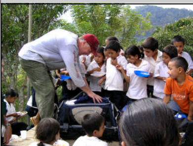
Below: Anxious school children wait to see their new school uniforms which were sewn by the women's sewing group.