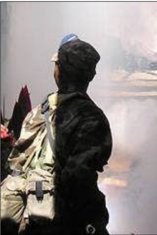
A soldier enters a residence in Pinalejo and fumigates both the home and the yard for mosquitoes which could transmit the deadly hemorrhagic form of the dengue fever virus.

There is a reason they call Dengue Fever “bone break” fever. The virus that is transmitted from the Aedes mosquito to the human it bites can cause a wide spectrum of symptoms not the least of which is severe bone pain. The high fevers, abdominal cramps and intense bone and joint pain makes this disease one of the more feared tropical illnesses. While the classical form of Dengue fever can leave its victim debilitated for several weeks, it is the hemorrhagic form that often times proves to be lethal. Dengue hemorrhagic fever occurs when a person has already suffered classical Dengue fever at least once. For those who live in endemic areas, the probability of contracting Dengue hemorrhagic fever increases with each subsequent episode.