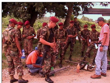
Above: Soldiers learn to operate the fumigation equipment. Below: The streets were filled with smoke as soldiers fumigated house to house.

However, thanks to those who have so generously supported the Fellow Man International project, the Foundation board was able to approve the necessary funds to purchase the insecticide and diesel fuel to fumigate the area. The Honduran military provided personnel to operate the fumigation equipment.. Both Center for Public Health officials and FMI clinic staff went door to door with the soldiers to help educate the people about the fumigation process and the need to eliminate any source of standing water that could serve as a nursery for mosquito larvae. There was much excitement in