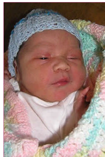
Proof that quality prenatal care can make a difference in the health of newborn babies born in rural areas.

"Five hundred dollars a month from FMI will ensure that over 140 school children have at least one well-balanced, hot meal a day"